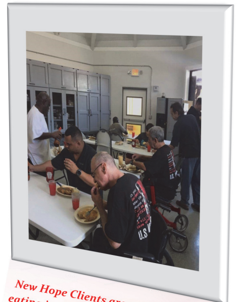
New Hope Clients are captured while eating in our newly remodeled kitchen

$40,000 CDBG grant from the City of Homestead and a $20,000 grant from The Protestant Foundation of Ocean Reef for kitchen equipment. Out heartfelt thanks goes out to both of them. We are still in need of $10,000 to buy a restaurant style industrial dishwasher. Believe it or not we are still washing dishes by hand.